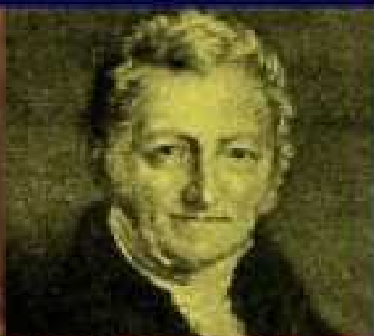
THOMAS ROBERT MALTHUS