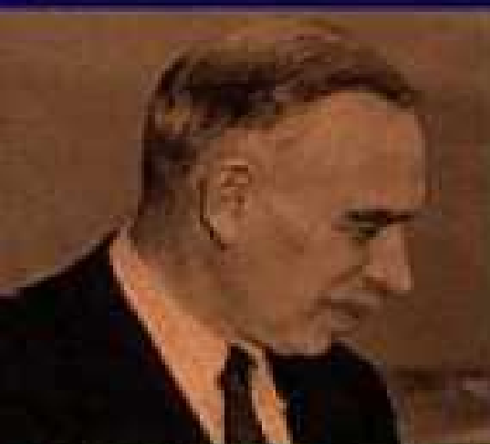
JOHN MAYNARD KEYNES

THE LIVES, TIMES, AND IDEAS OF THE GREAT ECONOMIC THINKERS