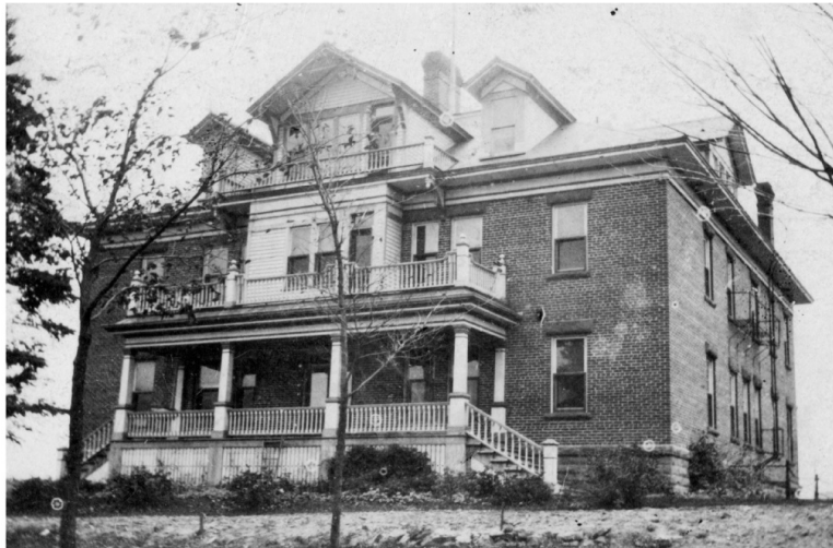
Poorhouses were common enough that they often appeared in offensive, idealized, or ominous early-twentieth-century postcards.