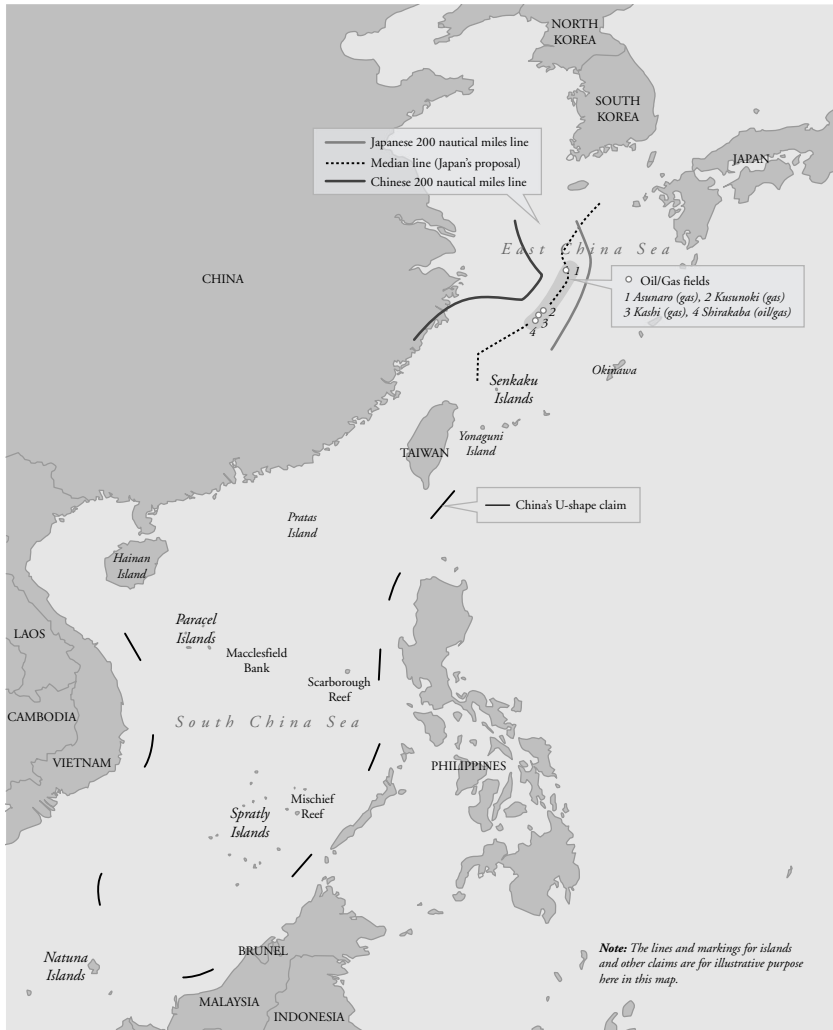
MAP 2. South and East China Seas.