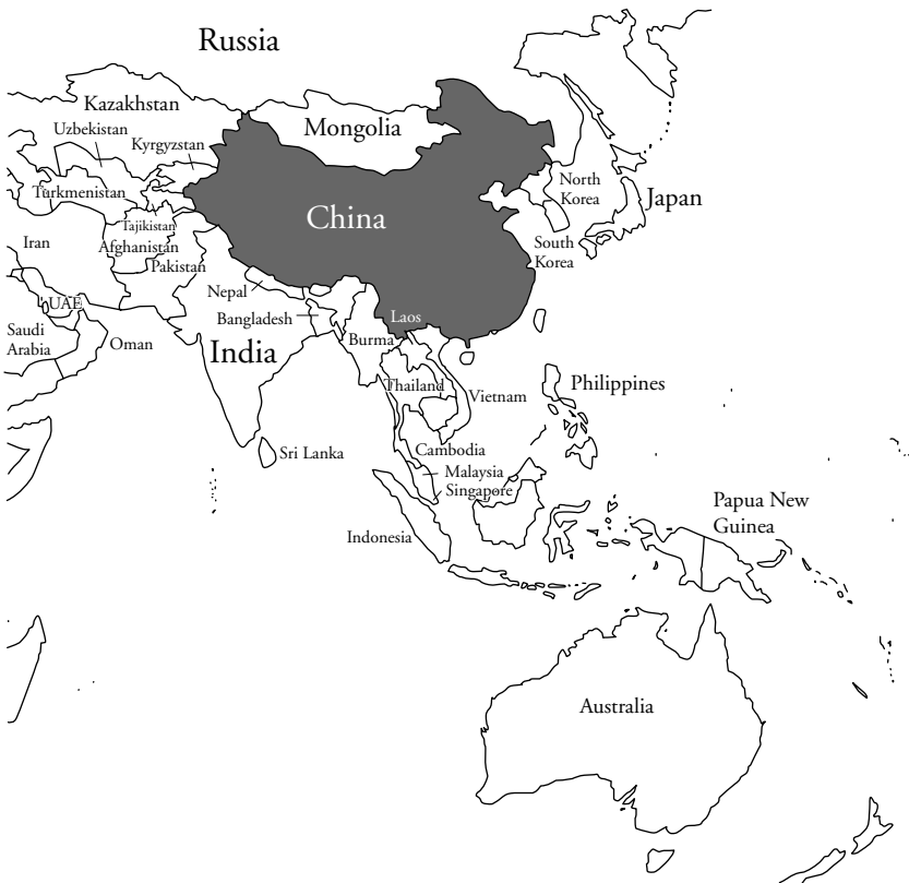
MAP 1. China and the Surrounding Region.